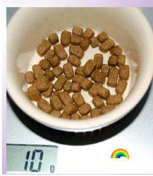
Figure 1- Sample daily 10g portion of the Science Selective Degu trial diet. Scales accurate to 1g, dish zeroed.